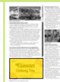
1/6 page Horizontal 112 x 64 mm.