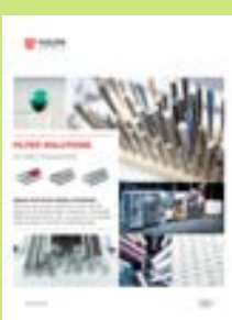
Alternate Chinese/English language advertising (Full page) 216 x 283 mm.