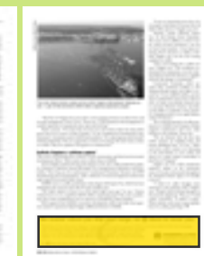
1/8 page Horizontal 178 x 35 mm.