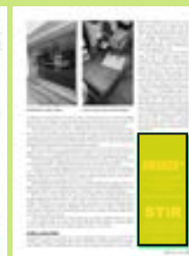
1/6 page Vertical 57 x 124 mm.