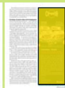
Half page Vertical 89 x 250 mm.