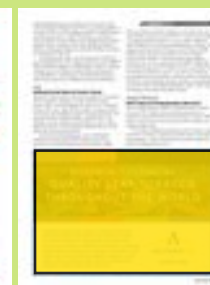
Half page Horizontal 178 x 124 mm.