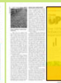
1/3 page Vertical 57 x 254 mm.