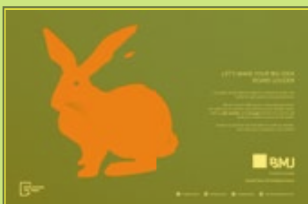
2 page Spread (full bleed) 426 x 283 mm.