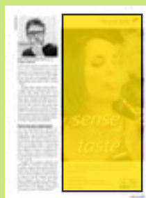
2/3 page 115 x 254 mm.