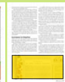
1/3 page Horizontal 178 x 83 mm.