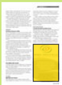
1/4 page Vertical 86 x 124 mm.