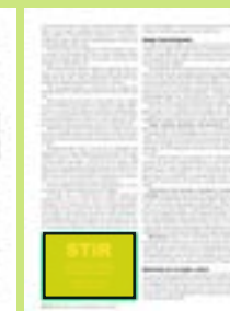
1/8 page Vertical 86 x 61 mm.