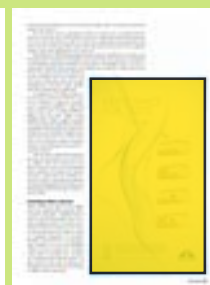
Island half page 115 x 191 mm.