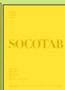
Full page non bleed 210 X 277 mm.